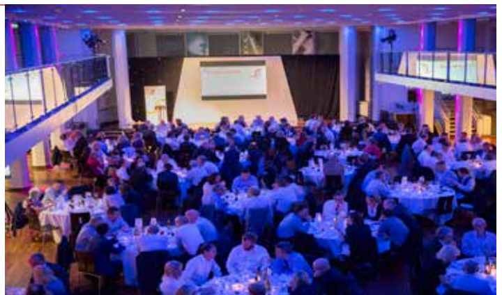
Peer and Stakeholder Recognition at a Gala Dinner

The primary aim of both Award schemes is to identify and publicise examples of excellence e.g. by dissemination of a shortlist brochure, highlighting in newsletters and other publications, presentations at events, and recognition at a gala dinner on April 2nd at the joint S-Lab/UKSPA Conference at the University of Birmingham. Hence, a relatively small amount of time spent on a Stage 1 application can create considerable publicity for your work even if unsuccessful in winning an Award.